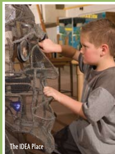
The IDEA Place