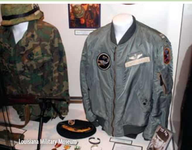
Louisiana Military Museum