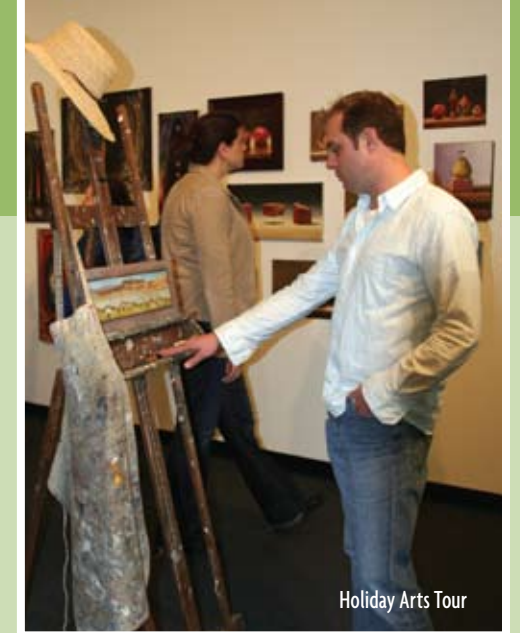
Holiday Arts Tour