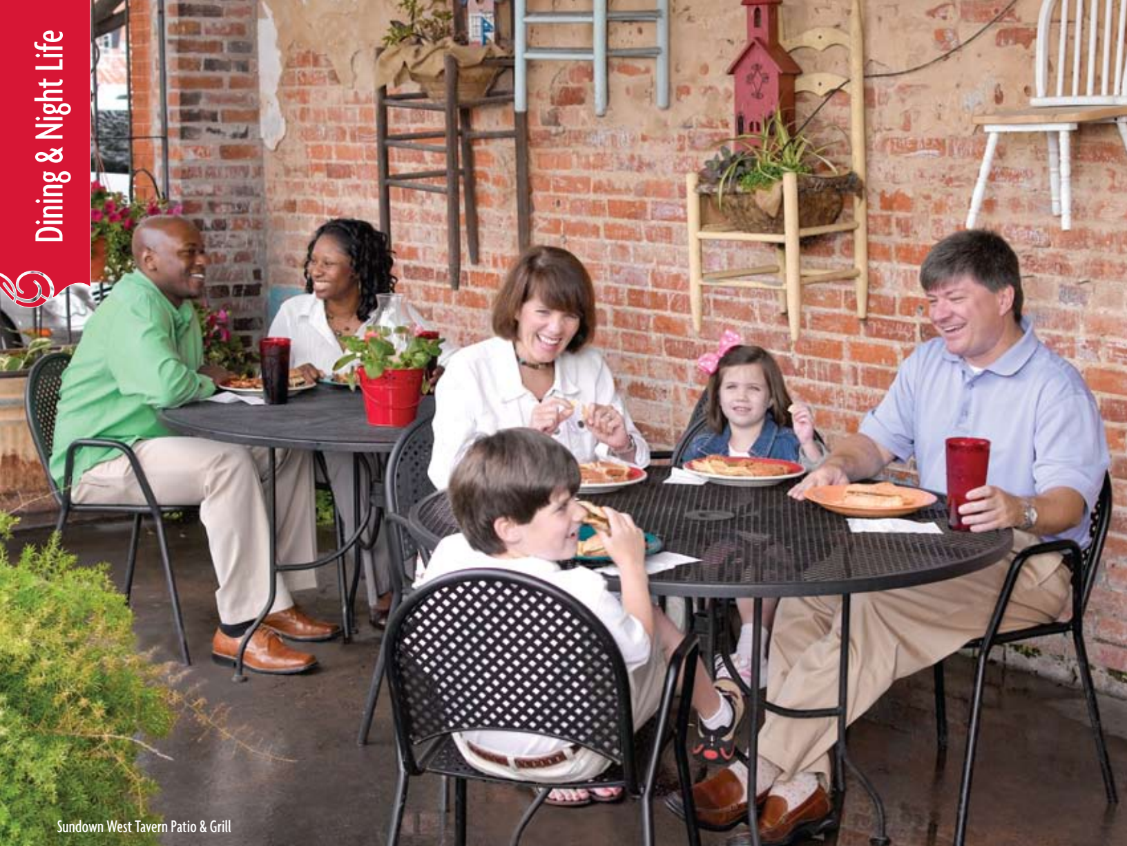
Sundown West Tavern Patio & Grill