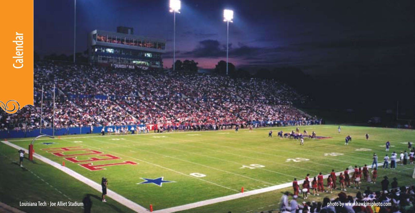
Louisiana Tech - Joe Alliet Stadium