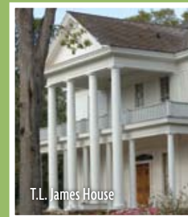
T.L. James House

“Lincoln Parish Park has possibly the BEST spectator viewing scenario of any XTERRA race course we have ever had the pleasure of racing.”