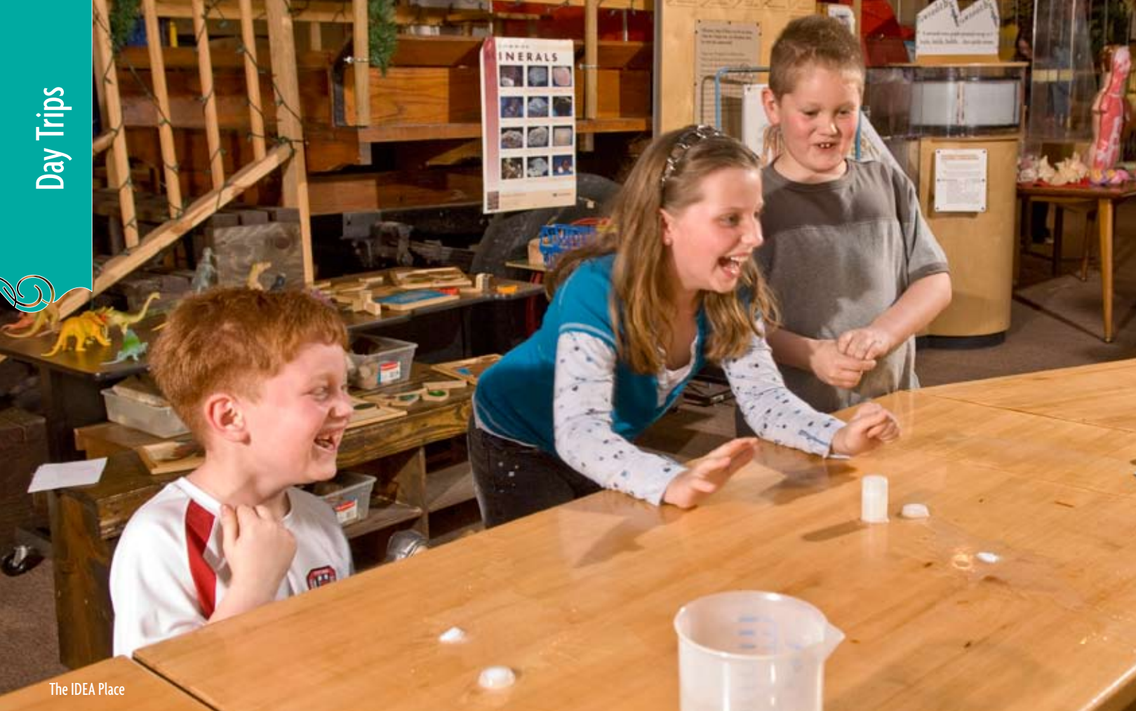
The IDEA Place