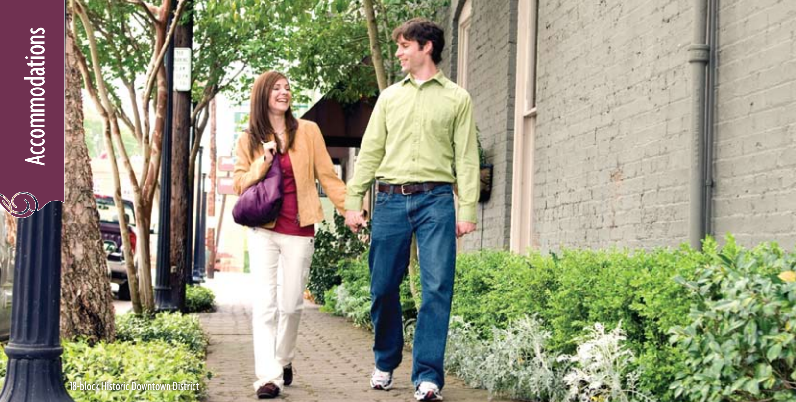
18-block Historic Downtown District