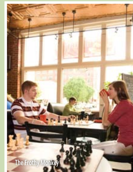
The Frothy Monkey

Wherever your dining experience takes you in Lincoln Parish, you're sure to find a variety of aromas and tastes guaranteed to leave the palate with an appreciation for Ruston.